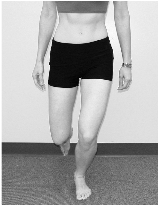
Fig. 3. Weight-bearing activities (such as the single-leg squat shown in the figure) should be done with particular attention to proper alignment of the pelvis, hip, knee, and ankle. (Reproduced from Powers CM, Souza RB, Fulkerson JP. Patellofemoral joint. In: Magee DJ, Zachazewski JE, Quillen WS, editors. Pathology and intervention in musculoskeletal rehabilitation. St. Louis (MO): Saunders Elsevier; 2008. p. 631; with permission.)

As strength, control, and balance progress, single-leg activities may be initiated. This is the final step before returning to full unrestricted activity. Considering that most patients are conditioned by their preoperative apprehension caused by patellar instability and that some patients may not have performed single-leg squats on the operated leg for years before the operation, the patient may not progress to this stage before 5 to 6 months after the reconstruction. In any case, rehabilitation from this point onward requires careful assessment and progressive development of proximal lower limb control.