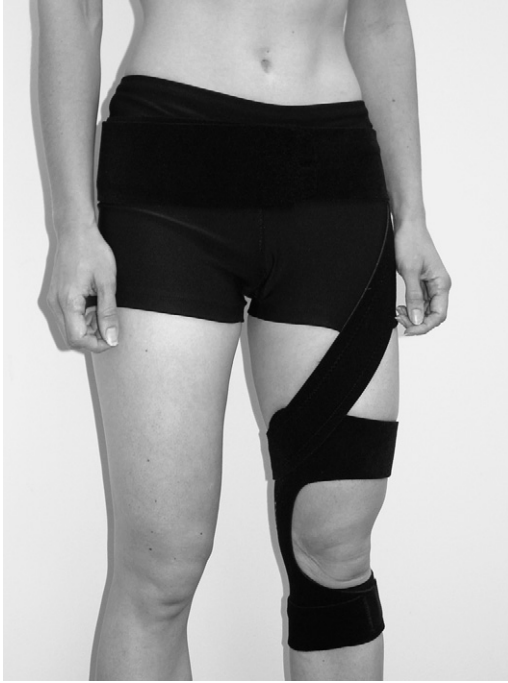
Fig. 4. Femoral strapping (Power Strap, Don Joy Orthopaedics Inc, Carlsbad, CA, USA) can be used to improve lower extremity control and kinematics during the rehabilitation program and functional activities. ( Reproduced from Powers CM, Souza RB, Fulkerson JP. Patellofemoral joint. In: Magee DJ, Zachazewski JE, Quillen WS, editors. Pathology and intervention in musculoskeletal rehabilitation. St. Louis (MO): Saunders Elsevier; 2008. p. 632; with permission. )